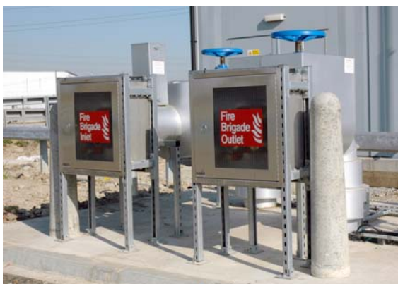
West Box Portal Breaching Point

The water supply is from a pair of four way Breaching outlets/inlets located at the top of each shaft (ground level). In order to activate the system the Fire Brigade connect their Fire Appliance to the breaching outlet (connected to Town's main water supply) and the breaching inlet (hydrant system water supply inlet). The Fire Brigade Appliance acts as the pump to provide the required flow and pressure to each hydrant valve.