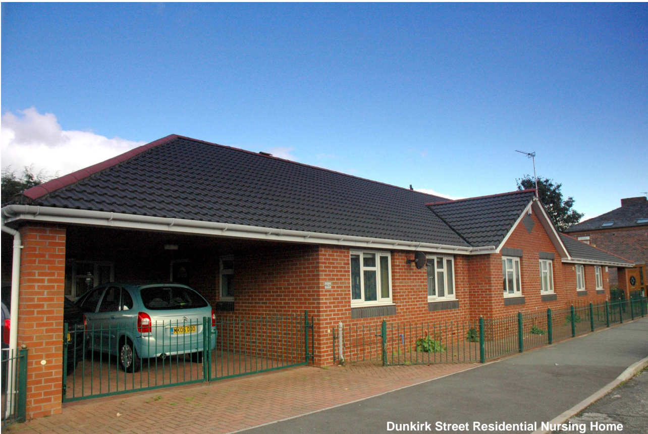
Dunkirk Street Residential Nursing Home